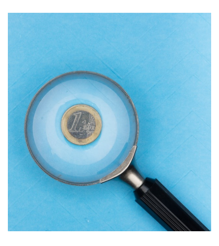
Where is it slow?