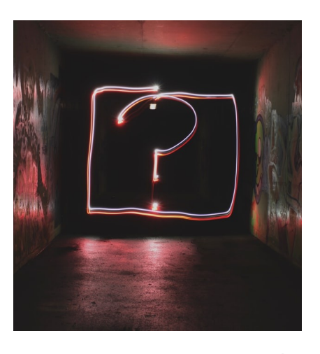
Why is it slow?