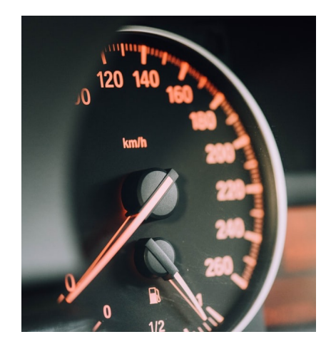
How slow is my code?