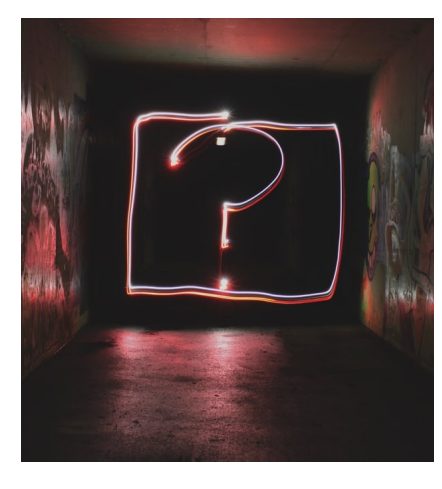
Why is it slow?