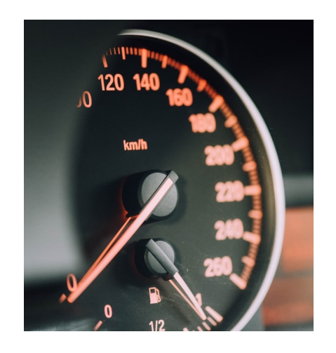
How slow is my code?