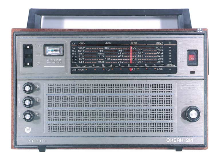
Figure 1. The radio that has been used in this study

To understand what this flaw is, I decided to follow the advice of my high school mathematics teacher, who recommended testing an approach by applying it to a problem that has a known solution. To abstract from peculiarities of biological experimental systems, I looked for a problem that would involve a reasonably complex but well understood system. Eventually, I thought of the old broken transistor radio that my wife brought