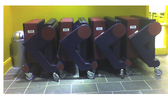
Four unattended AVC Advantage voting machines in a polling place accessible to the public, the weekend before an election [10].

Appel had previously purchased five surplus AVC Advantage 5.00E machines from a county in North Carolina. Halderman and Feldman reverse-engineered the hardware and parts of the software of these machines in 2007 [11].