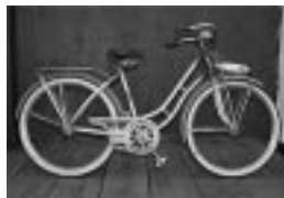
1937 Columbia Superb