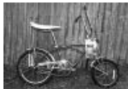
1999 Schwinn Grape Crate