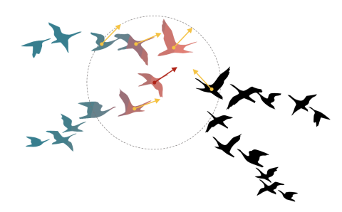
Fig. 1. A bird is influenced by its neighbors within distance r.

fixed positive \varepsilon_o . By space and time scale invariance, we may assume<sup>1</sup> that ||x_i(0)|| \le 1 and ||v_i(0)|| \le \sqrt{\rho/n} for all birds i. We state our main result: