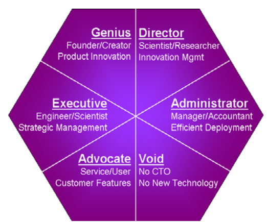
Figure 1. CTO Categories, Skills, and Focus

The CTO position is occupied by people with diverse backgrounds, as is common to other executive positions like the CEO, COO, and CIO. Since the CTO position is often confused or interchangeable with the CIO position, and since both are relatively new to the executive ranks, it should be no surprise that the skill and background of the CTO is at least as diverse as that found in the CIO position.