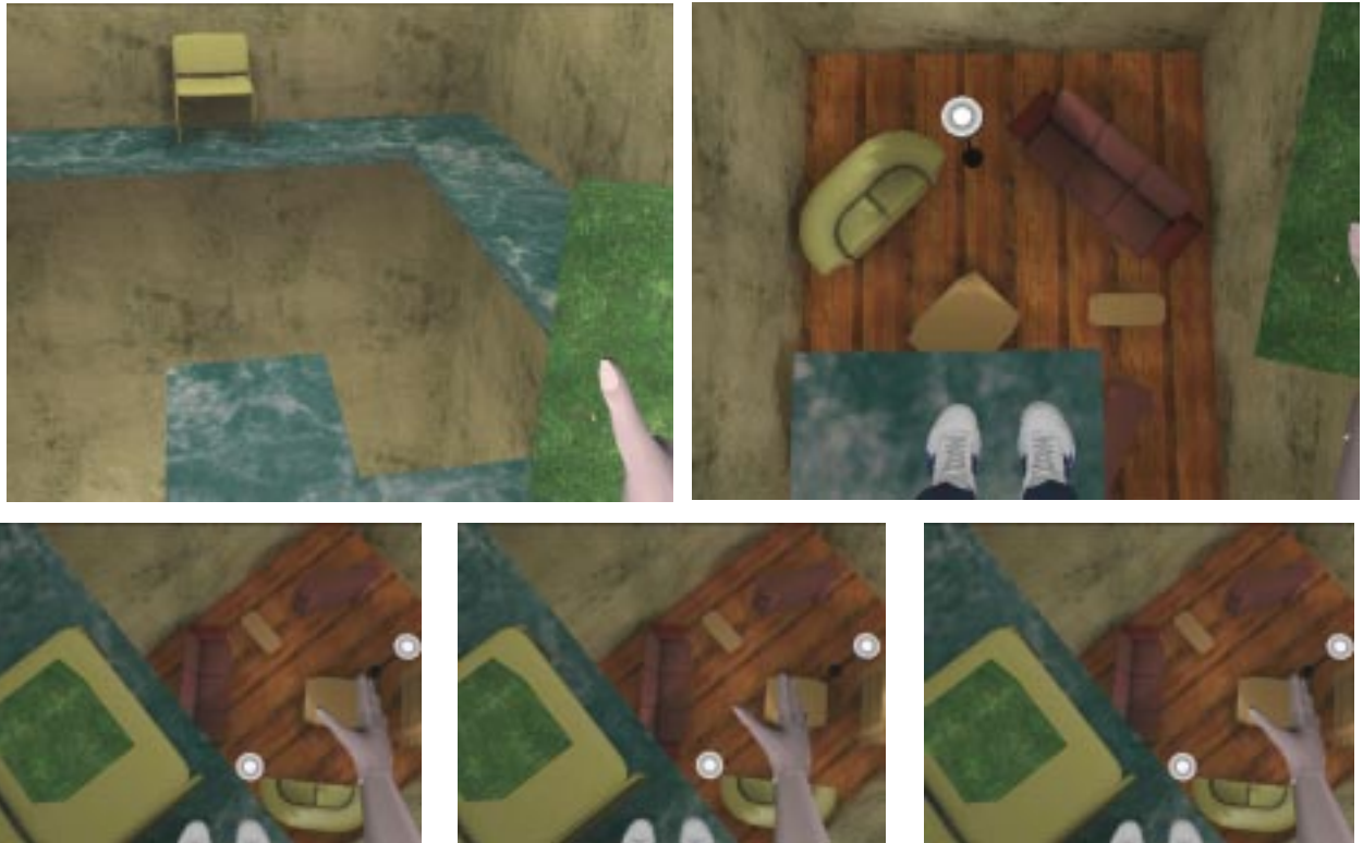
Figure 3. Sequence of images of the environment. The top left image shows a subject’s view when entering the pit room. The top right shows the view when standing on the “diving board” on the ledge. The bottom images form stereo pairs of the view when looking down from beside the target chair (the left two images are for wall-eyed viewing; the right images are for cross-eyed viewing).

When a user enters the virtual room leading off the corridor, he or she is on a 0.7 m wide ledge 6 m above the floor of the room. The ledge goes all the way around the room and there is a chair on the ledge on the far side. The floor below is populated with living room furniture. A direct path from the doorway to the chair would mean walking out onto “empty space”. However, it is possible to get to the chair “safely” by going along the edge of the room. This scene is inspired by Gibson’s visual cliff experiment [Gibson, 1960] and fear-of-heights work by other researchers [Rothbaum, 1995].