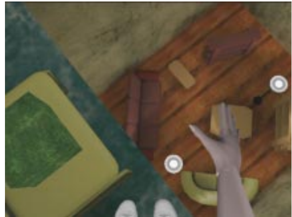
Figure 1. View over virtual ledge.

Copyright ACM 1999 0-201-48560-5/99/08... $5.00