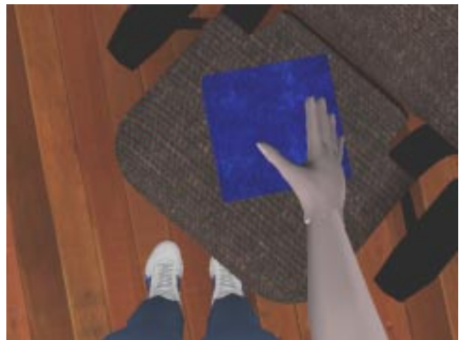
Figure 4. View showing avatar.

Several researchers have undertaken the quantification of presence [Slater, 1994; Ellis, 1996; Pausch, 1997]. Subjective reporting using questionnaires is the most common method. This method, however, relies on eliciting responses about subjects’