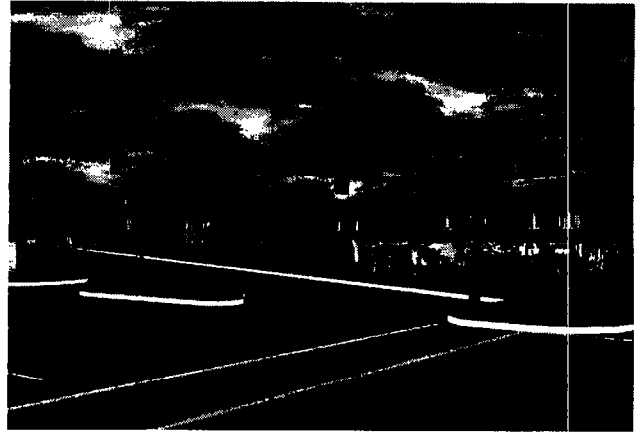
Pico Union Neighborhood Model

While these projects look at redevelopment occurring in existing areas, another project focuses on conceptual modeling of a new