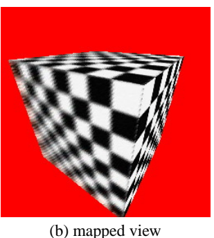
rce view (b) mapped view