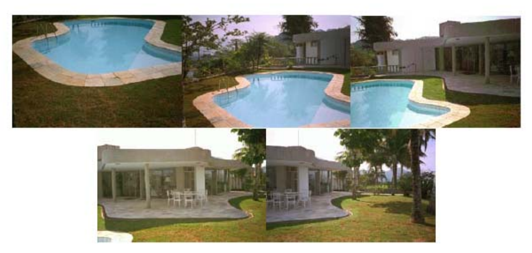
Figure 1: Views from five cameras

Given two cameras, a natural thing to do would be to compute how the scene currently seen from camera 1 would appear from camera 2's point of view. In particular, this would allow one to paste together multiple images which have overlapping regions, even if those images were obtained from different locations. This is also called Mosaicing .