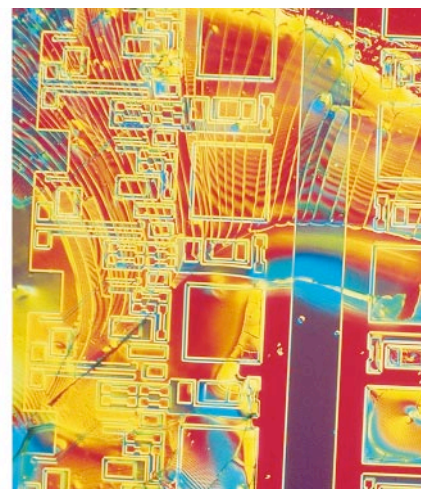
An early stored-program computer (left), built around 1950, used vacuum tubes in logic circuits, whereas modern computers use transistors and silicon wafers (right), but both are based on the same principles.

that a cell receives from its environment can influence which genes it expresses — and thus which proteins it contains at any given time — or even the rate of mutation of its DNA 13 , which could lead to changes in the molecular structures of the proteins. This is in contrast to physical systems where, typically, macroscopic perturbations or higher-level structures do not modify the structure of the molecular components. For example, the existence of vortices in a fluid, although determined by the dynamics of molecules, does not usually change the nature of the constituents and their molecular interactions.